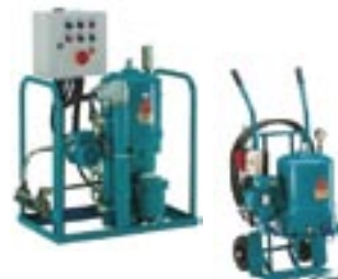
CCJENSSEN Filtration systems