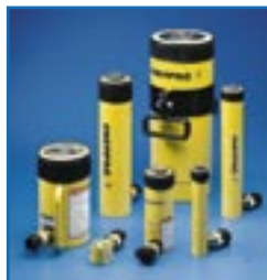
ENERPAC High Force Tools